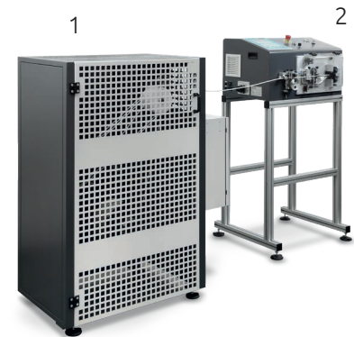
Inline assembly example: 1 Motorized dereeler 2 Cut, strip & unjacket machine